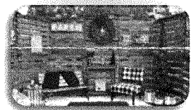
IEC's Outdoor Neighborhood Family Photo Spot

On a warm December day, our neighborhood church, Iglesia Evangélica Cristiana (IEC), prepared a picnic supper of two hundred grilled chicken dinners to share with those living within a few blocks of the church. We went house by house inviting our neighbors to come. Many live such secluded lives that they have no idea who lives by them. What a joy to see so many not only come, but also linger around the dinner tables, enjoying the fellowship. What a blessing to us, personally, to get to know them better!